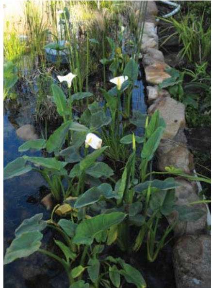
Part of the wetland created by Versvelds in their back yard

If anyone is interested in doing this to their swimming pool you may call Janine on 0836599822. It's a great way to invite the wild out there into your front garden.