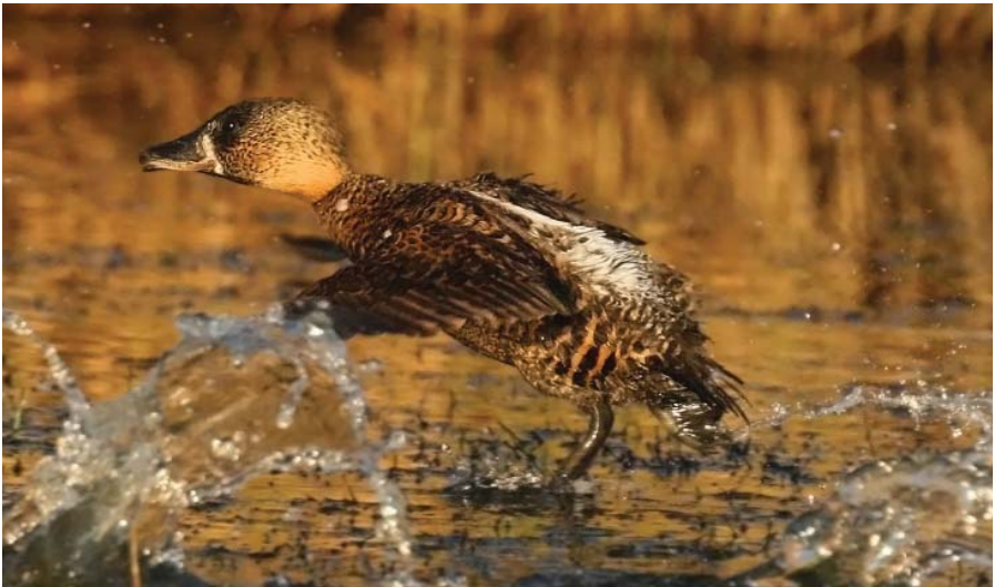
The characteristic white mark at the base of its bill and the diagnostic white back of the White-backed Duck. It flaps on the surface of the water to get sufficient speed to take off.