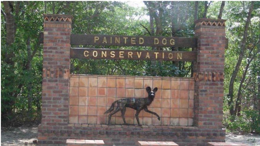
The entrance to the centre.