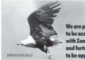
AFRICAN FISH EAGLE

We are privileged to be associated with Zandvlei Trust and fortunate to be opposite a beautiful natural area