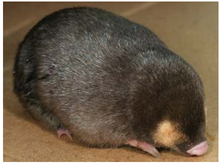
The Cape Golden Mole